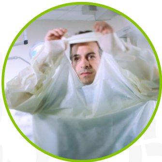
Fast, easy-don/easy-doff over-the-head design