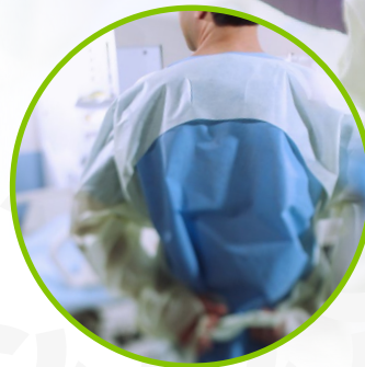
Open back provides increased ventilation and comfort