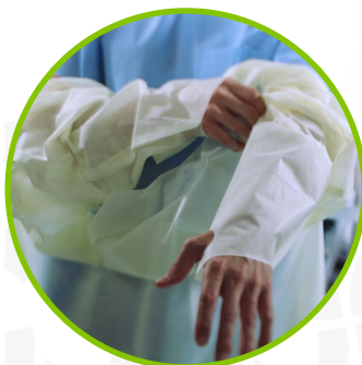
Thumb hooks help keep gloves in place while you work